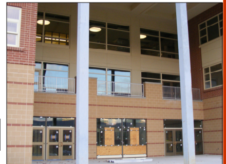
Main Entrance ▶