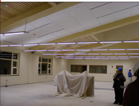
◀ High School Library