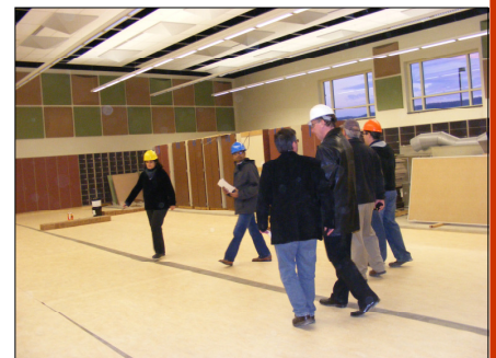
Band Room Area ▶