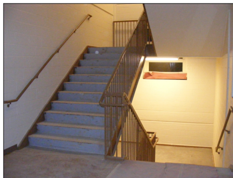
◀ Interior Stairway