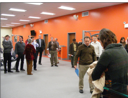
Members tour Fitness Center including locker rooms and saunas

This beautiful, versatile building was designed and built to LEED standards and has qualified for Silver and possibly Gold Certification. The Center for Wellness will be the first LEED certified building in Blair County. Some of the components that were incorporated into this building for LEED certification are 30 wells that were drilled for the geothermal heat pump system; recycled and recyclable and rapidly renewable building materials were used; natural light requirements for LEED were met throughout the building; and the use of energy conserving light fixtures as well as water conserving plumbing fixtures.