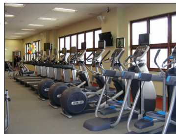
Treadmills and steppers line one side of the Fitness Center

It's easy to see why Sheetz is consistently voted as one of the best places to work!