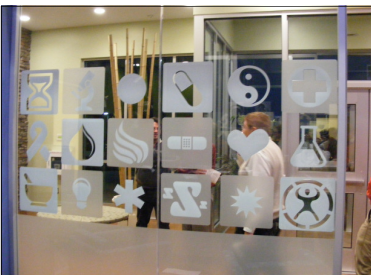
Interesting graphics mark the entrance to the Wellness Center

The approximately 10,000 square foot facility provides exercise equipment and a separate room that provide opportunities for Zumba, yoga and other similar activities. In addition, various sessions can be held for large groups so that educational materials and information can be distributed or meetings held for other similar purposes. The Wellness Center section is available for most of the day and night staffed by nurse practitioners who can offer care for minor illness or injuries and to work with the employee to develop an overall wellness plan for better health.