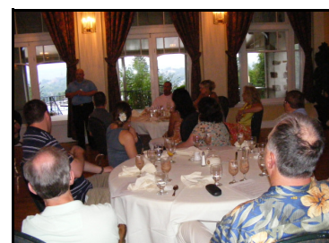
Members and guests enjoy evenings festivities