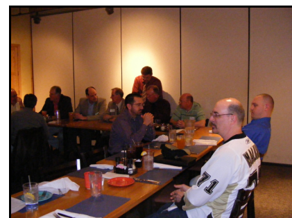
▲ ASHRAE members join the Middle Chapter for a presentation outlining the 2009 LEED changes