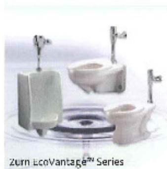
Zurn EcoVantage™ Series