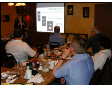
Group listens to discussion of LED lighting vs. incandescent