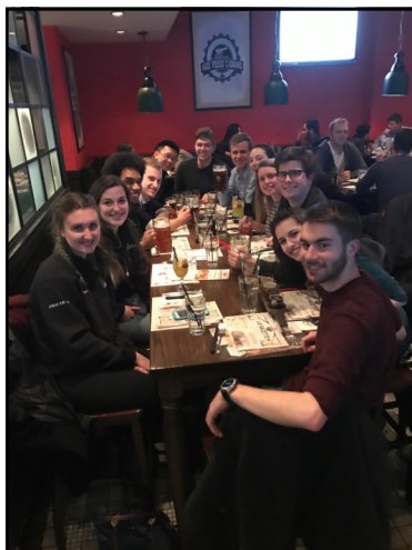
Dinner in Toronto

We would also like to thank the local Middle PA AIA Chapter for their generous donation of $1,000 to credit our org. This donation helps to fund trips like this.