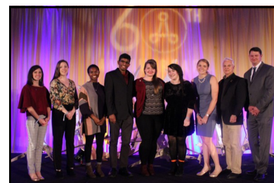
New Board of Directors