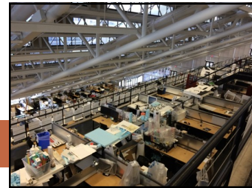
Harvard's Architectural Studio