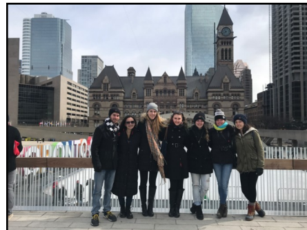
Toronto City Hall