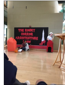
Charlie Brown Movie Skit Winners