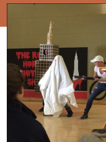
Ghost Busters Skit Entry