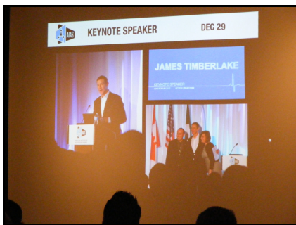
One of the slides shown during AIAS presentation